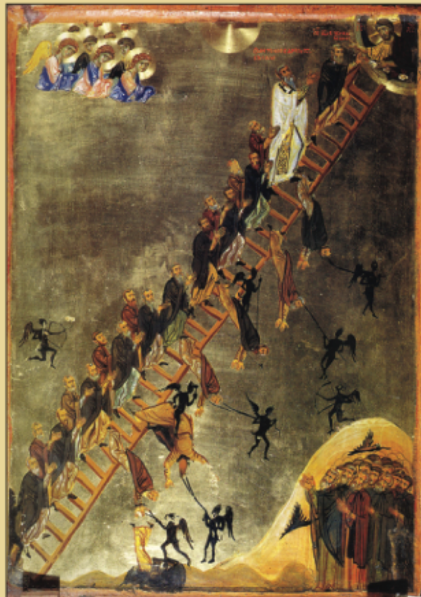
Icon of the Ladder of Divine Ascent