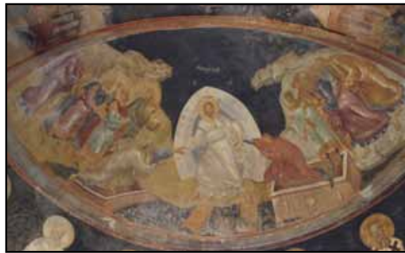
Christ the Savior in Chora, Constantinople

Learn what they accomplished for ecumenical dialogue and the Church.