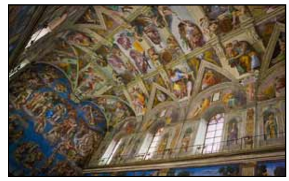
The Sistine Chapel, Rome

Explore historical sites of the Roman and Byzantine empires, including: