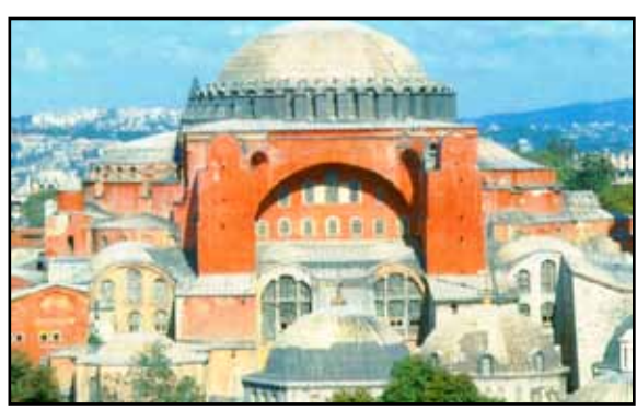
Hagia Sophia, Constantinople