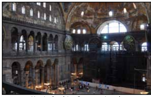
Hagia Sophia, Constantinople

Attend religious prayer services thoughout the tour.