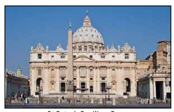
St Peter's Basilica, Rome

Visit major religious site in Rome and Constantinople (Istanbul), including: