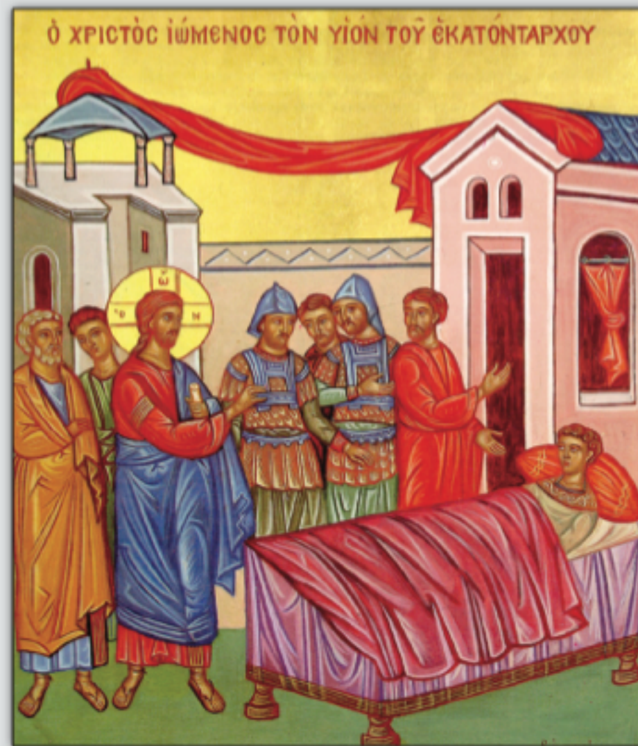
Icon of Christ Healing the Centurion's Servant