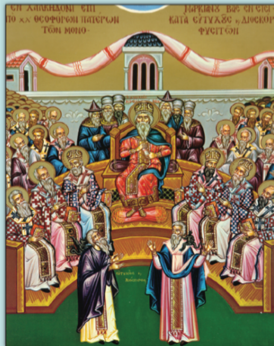
Icon of the First Six Ecumenical Councils