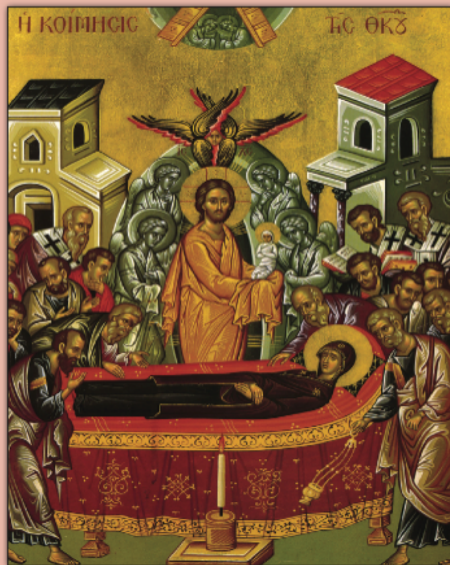
Icon of the Dormition of the Theotokos -- August 15th