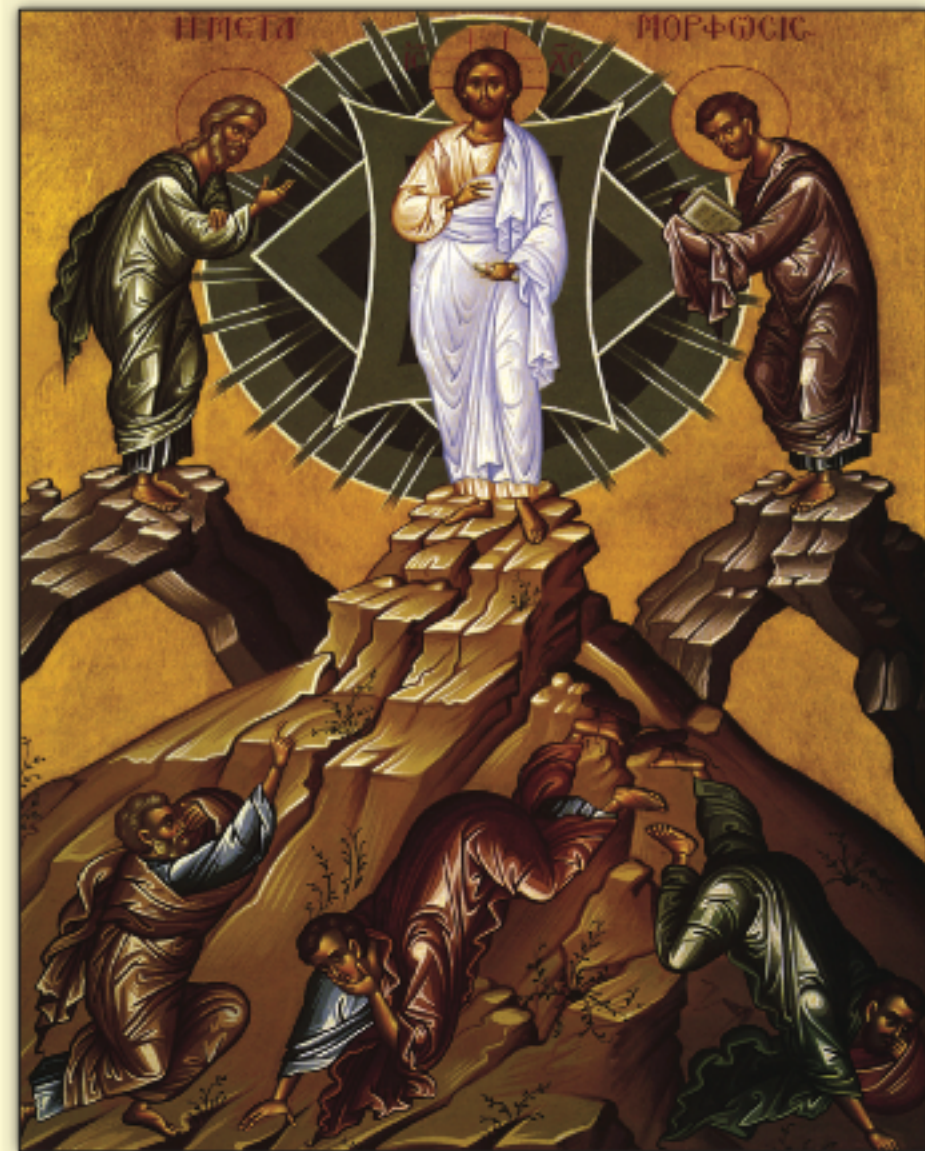
Icon of the Transfiguration of Our Lord