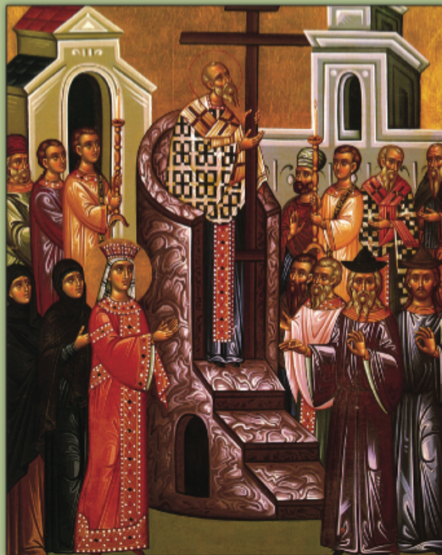
Icon of the Elevation of the Holy Cross