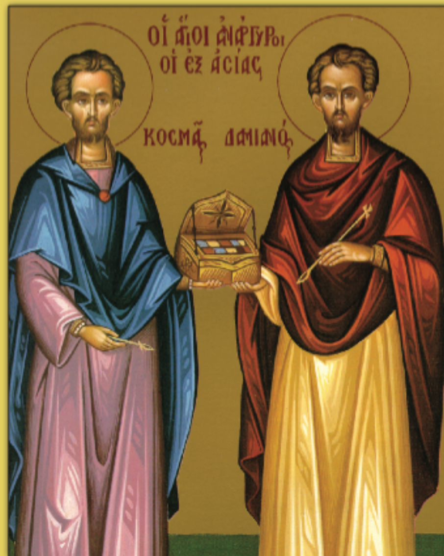
Icon of Saints Cosmas and Damian -- November 1st