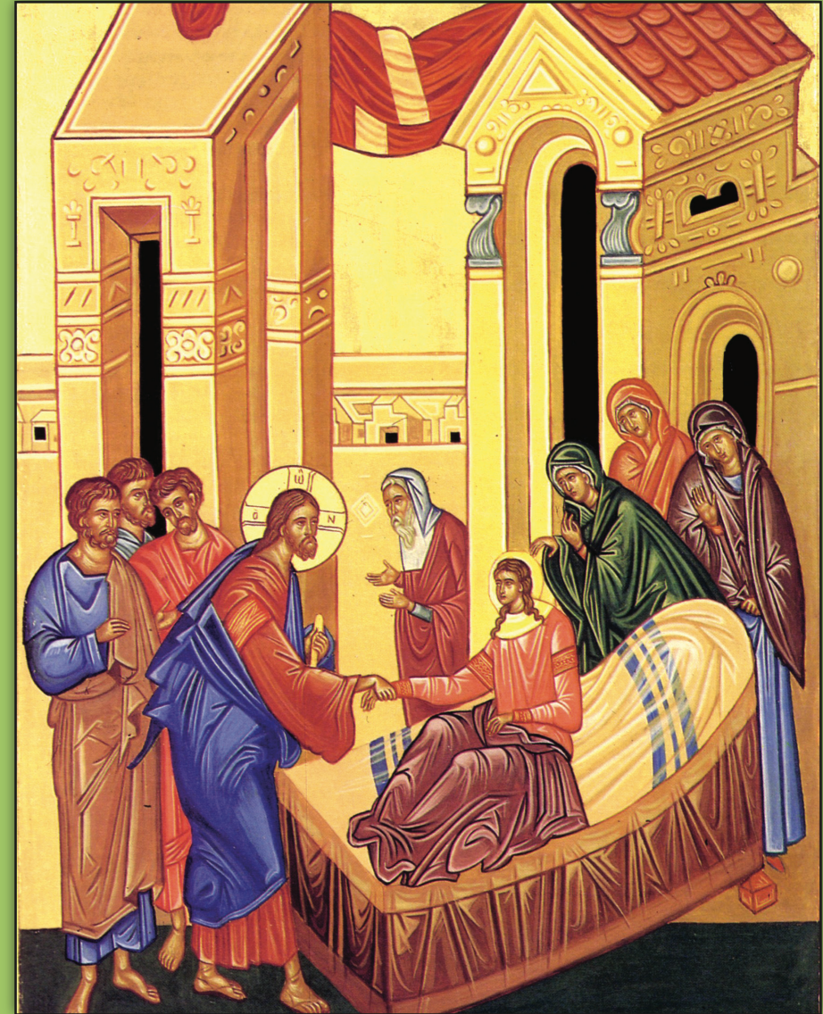
Icon of the Healing of Jairus' Daughter

Visit www.ecpubs.com for more publications.