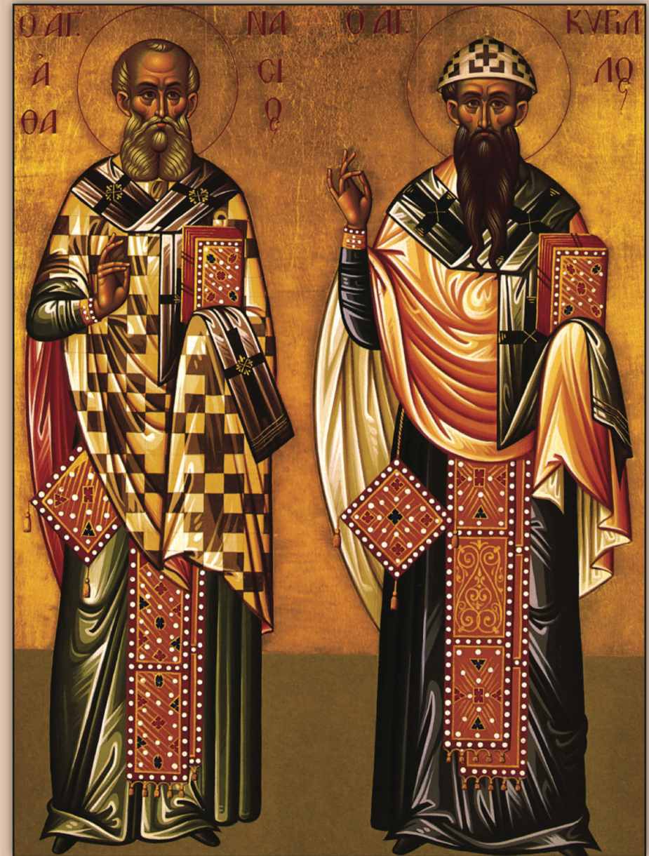
Icon of the Holy Fathers Athanasius and Cyril -- January 18th