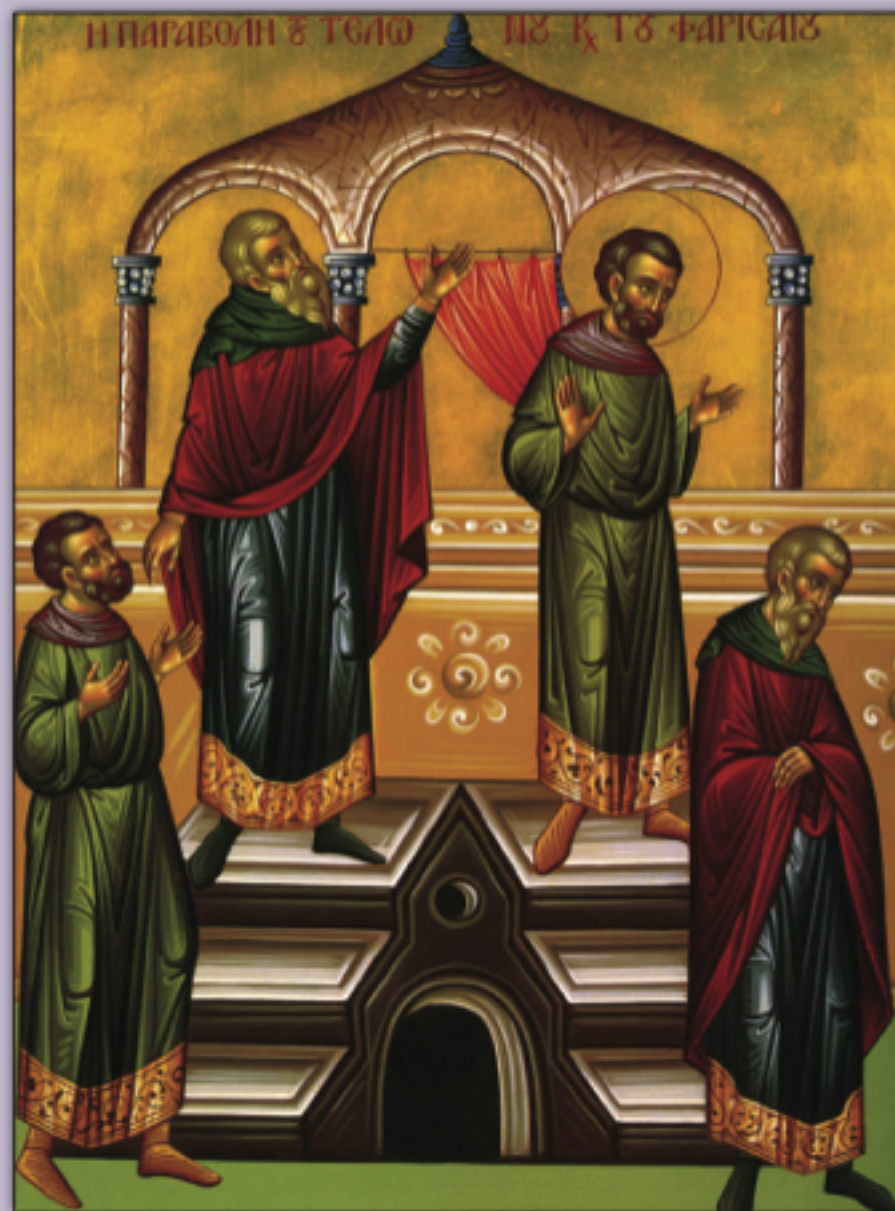
Icon of the Publican and Pharisee