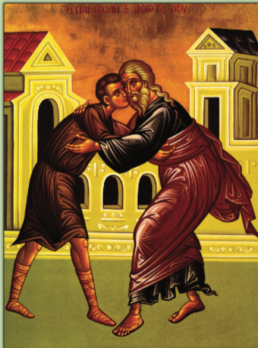
Icon of the Prodigal Son