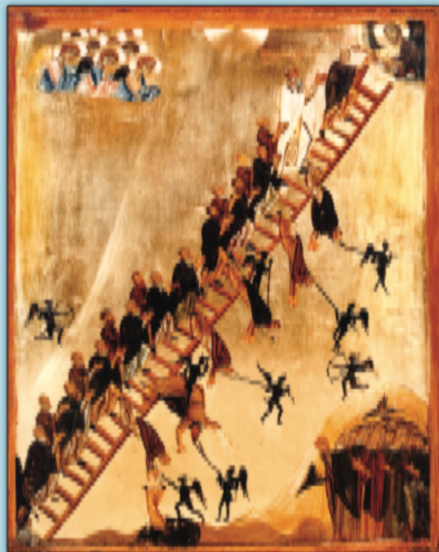
Icon of the the Ladder of Divine Ascent