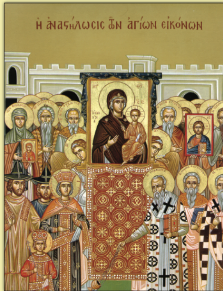
Icon of the Holy Images