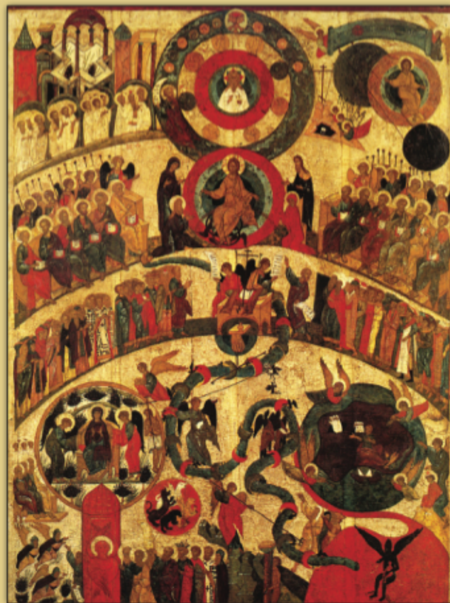
Icon of the Last Judgment