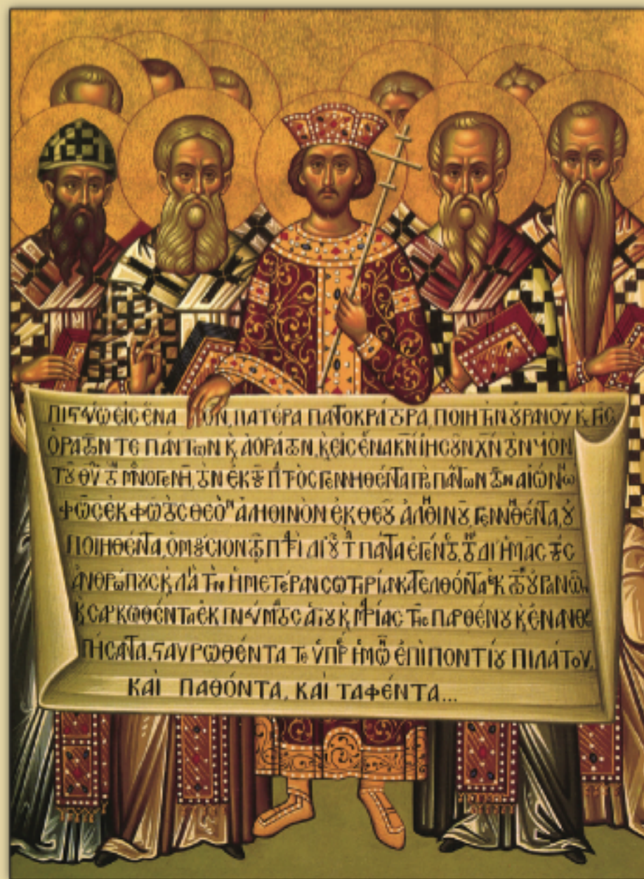
Icon of the Fathers of the First Ecumenical Council of Nicea