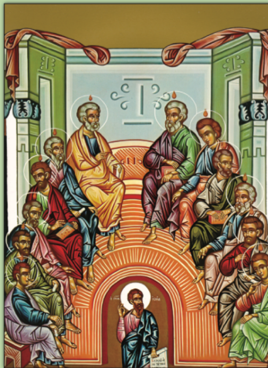
Icon of Pentecost