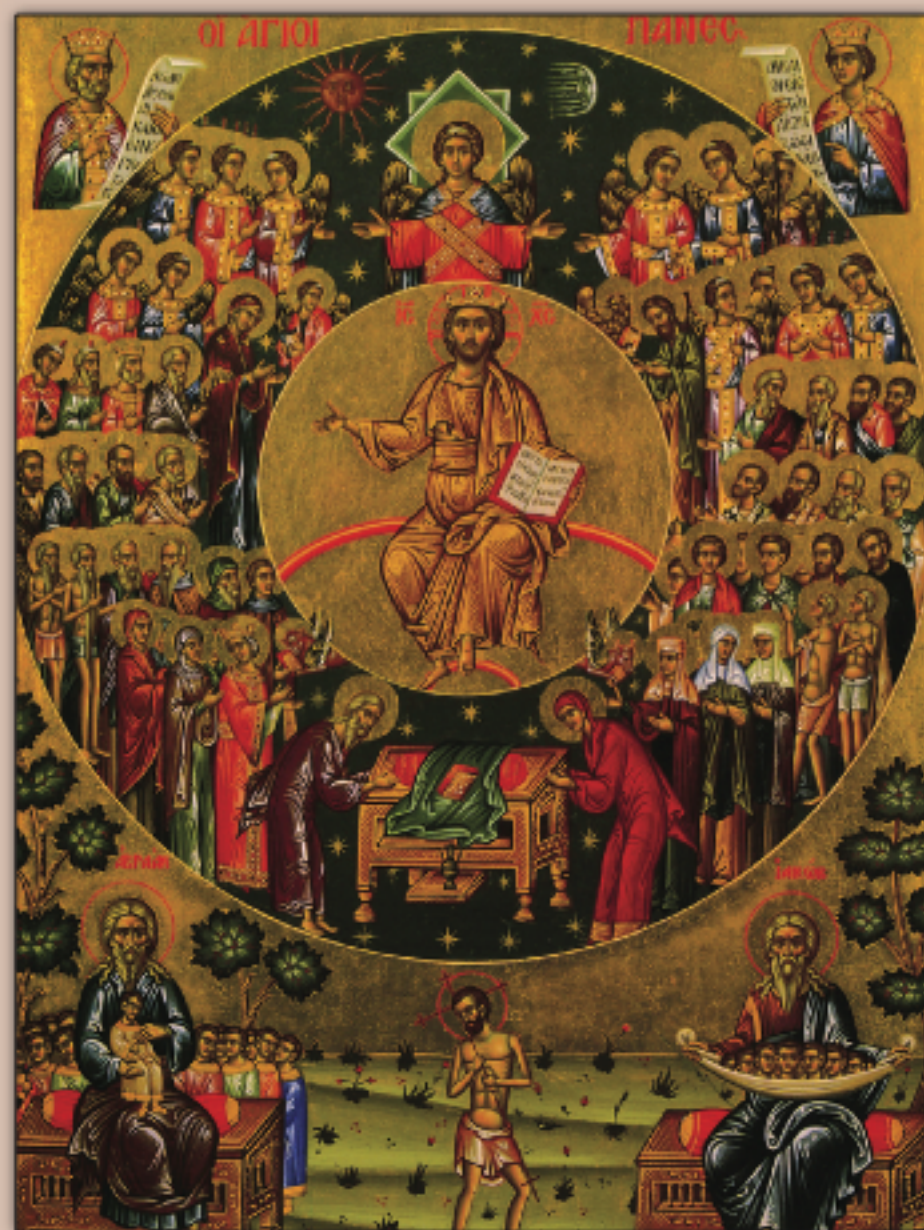
Icon of All Saints