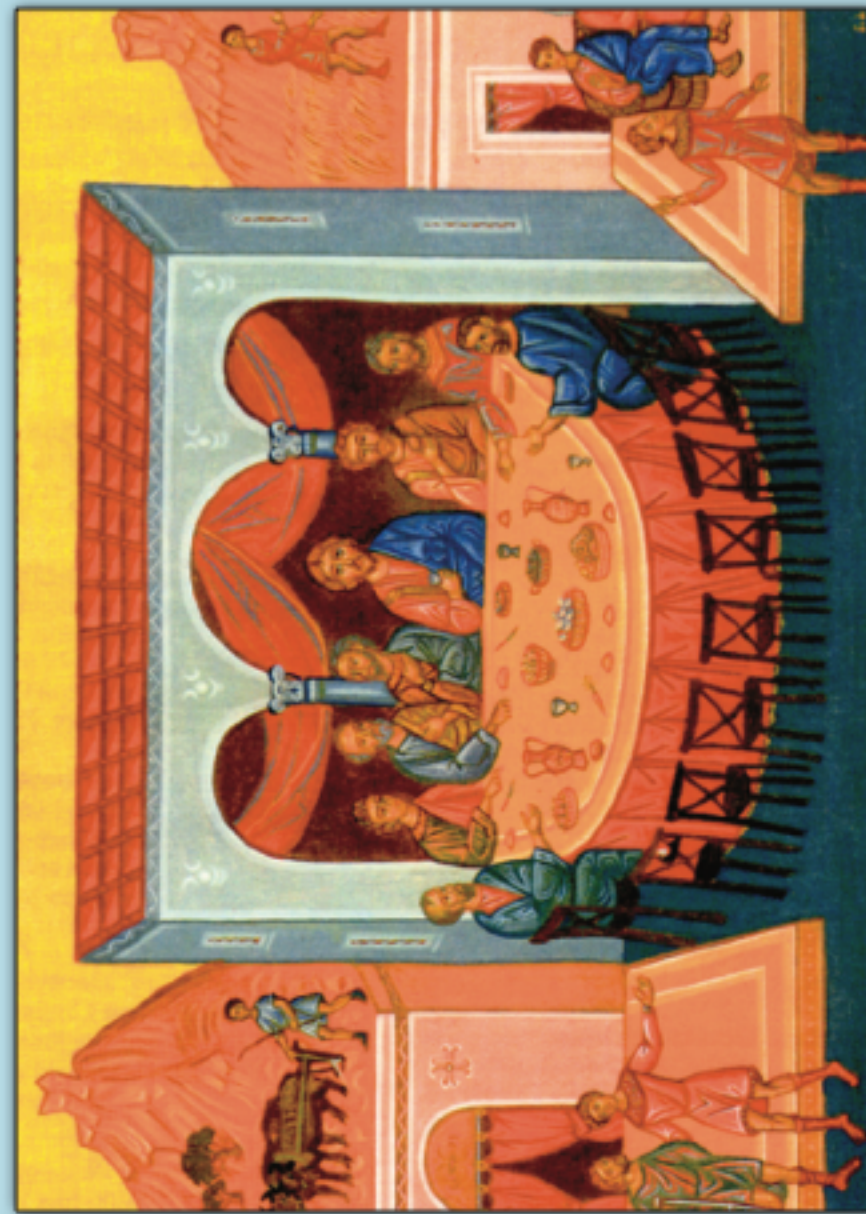
Icon of the Parable of the Wedding Banquet (Matthew 22:1-14)