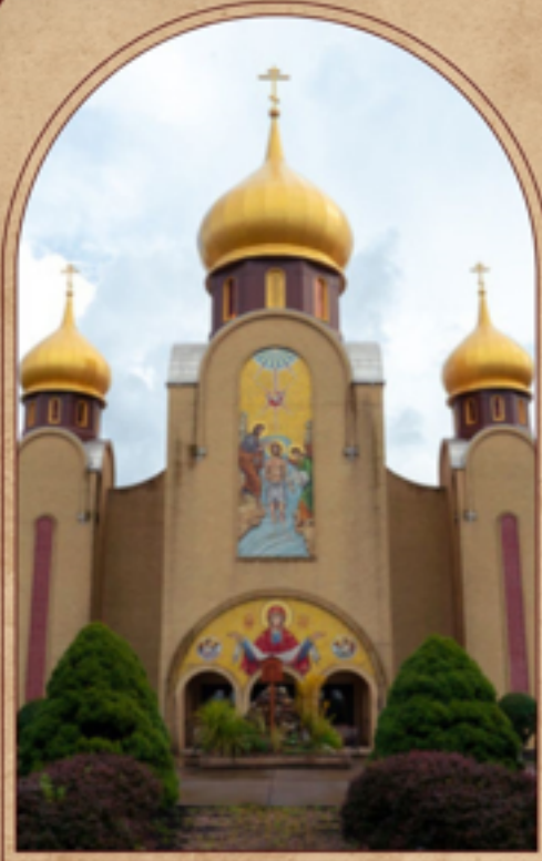
Cathedral of St. John the Baptist 1900 Carlton Rd, Parma, OH 44134

JOIN US AS WE CELEBRATE OUR FINAL HOLY DIVINE LITURGY