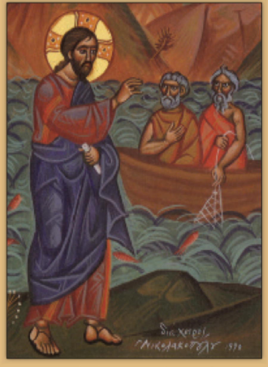
Icon of the Call of the Apostles (Luke 5:1-11)