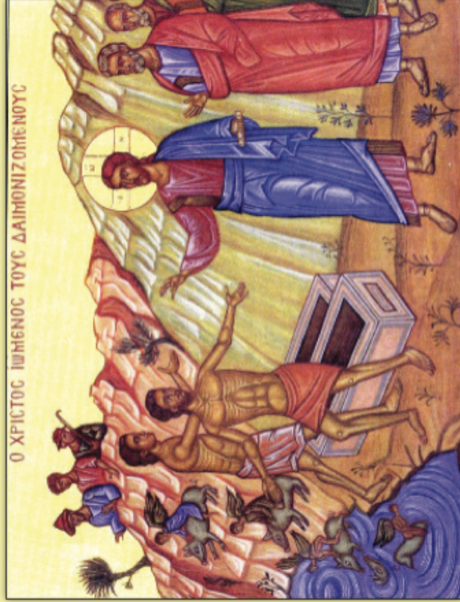
Icon of Healing the Gadarene Demoniacs (Luke 8:26-39)