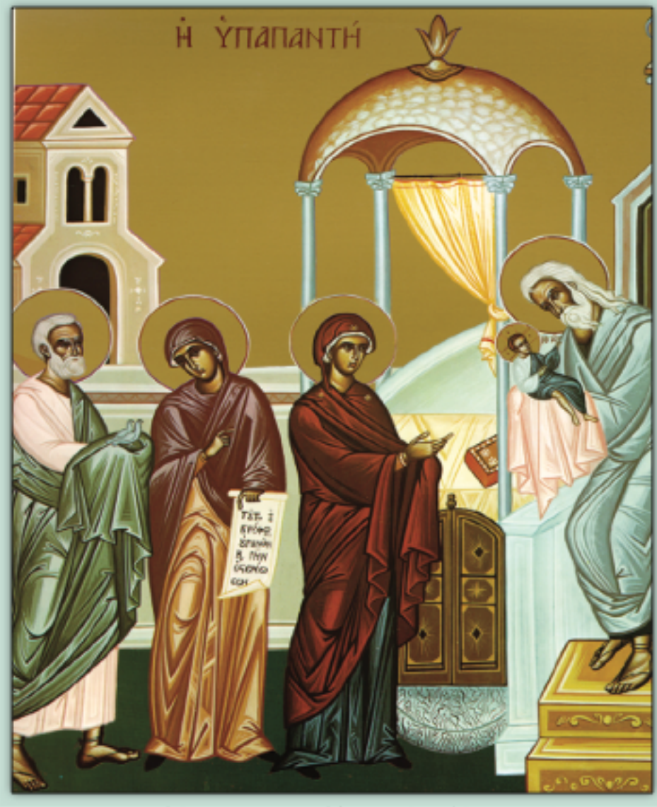
Icon of the Presentation of Our Lord -- February 2nd