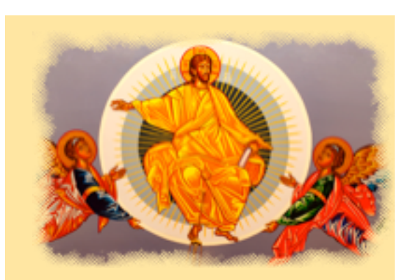
Family Catechesis Sunday, February 16th Noon - 1:30pm