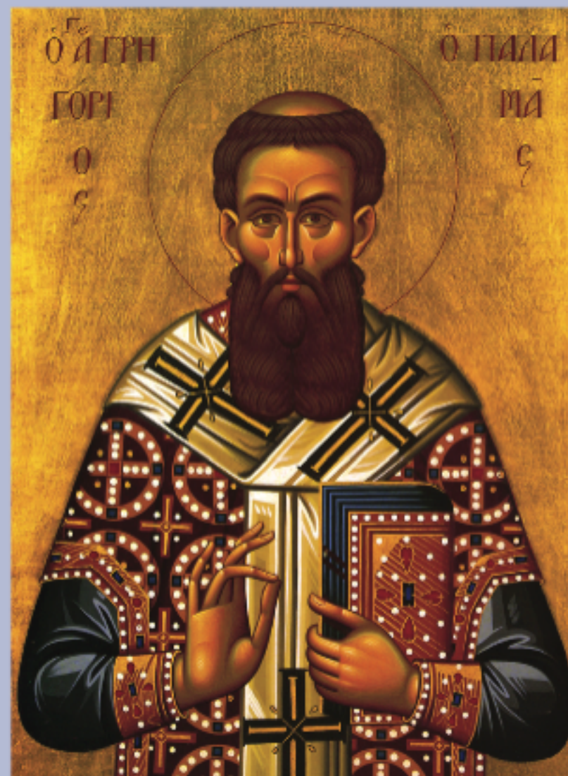
Icon of Saint Gregory Palamas