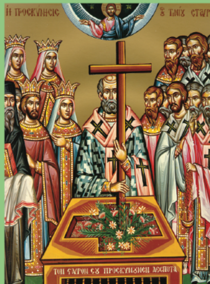
Icon of the Veneration of the Holy Cross