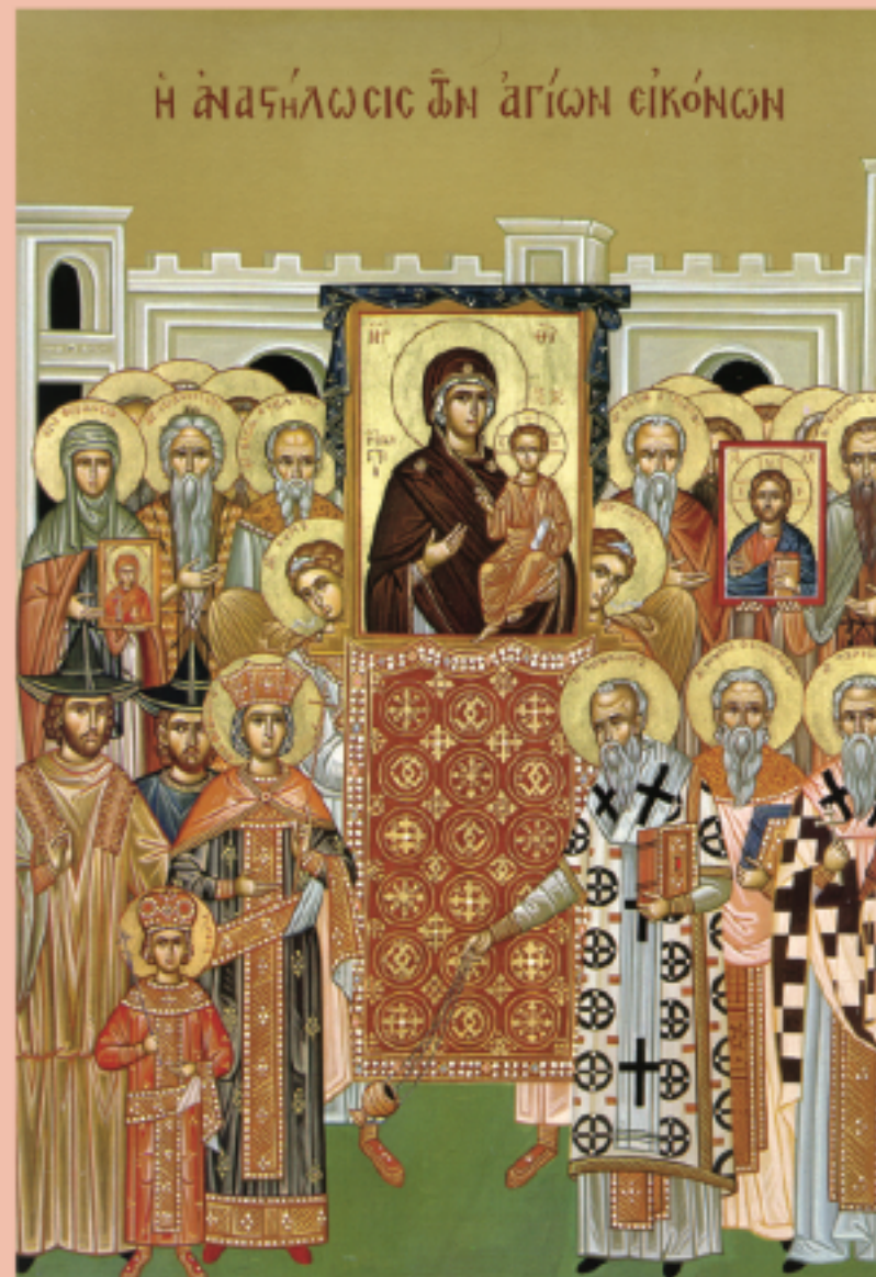
Icon of the Holy Images