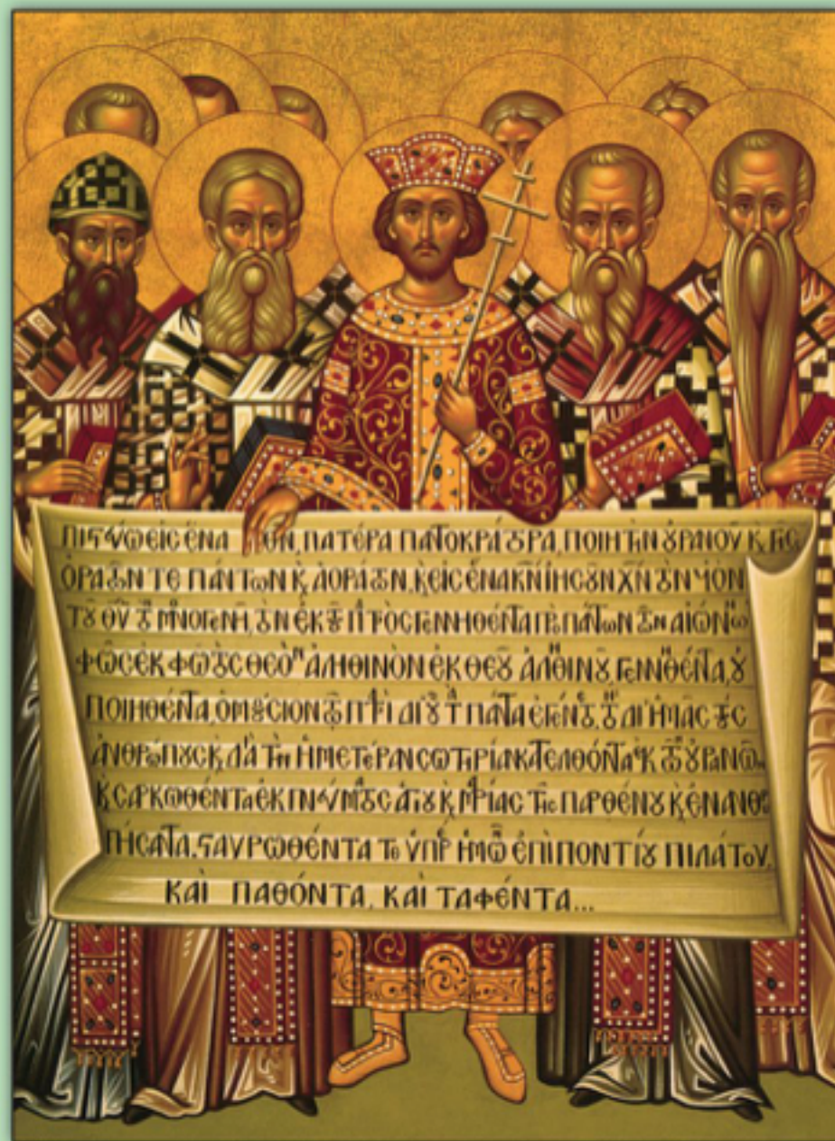
Icon of the Fathers of the First Ecumenical Council of Nicea