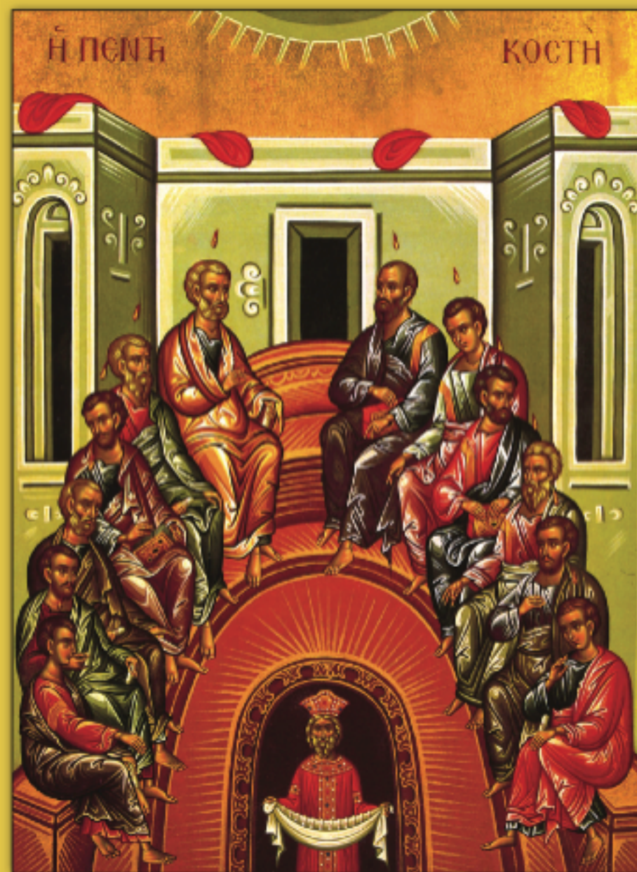
Icon of Pentecost